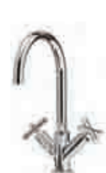
Kontro Chrome KON3/CH