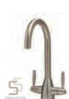
Avel Stainless Steel AVE/SS