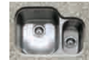
Form 150 Undermounted stainless steel sink FORM150U/R