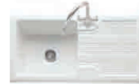
Colorado 100 Ceramic inset sink with drainer CPK1500 waste required CO100