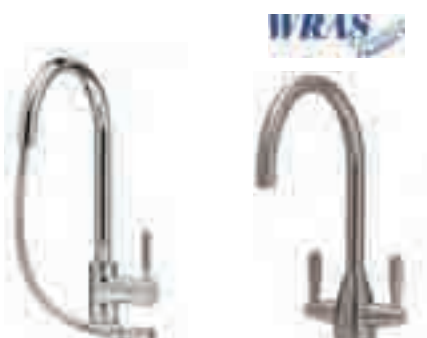
Aspen Spray ASPS2/CH