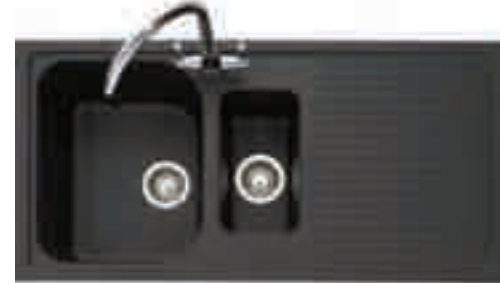
Envoy 150 Inset Geotech granite sink with drainer (Granite only) ENV150GR