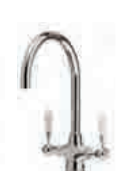
Shaftsbury Chrome S/CRU4/CH