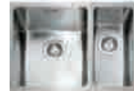
Mode 150 Inset or undermounted stainless steel sink MODE150R