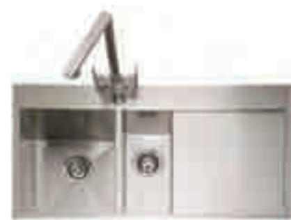
Cubit 150 Inset stainless steel sink with drainer CU150/L or R