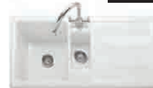
Colorado 150 Ceramic inset sink with drainer 2 x BSW/OF/SS2 waste required CO150