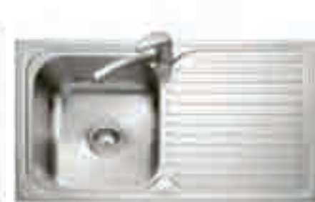
Dove 100 Inset stainless steel sink with drainer DO100SS