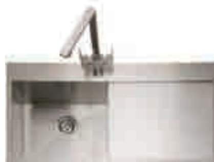
Cubit 100 Inset stainless steel sink with drainer CU100/L or R