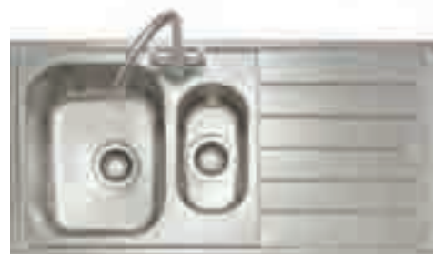
Lyon 150 Inset stainless steel sink with drainer LY150SS/L or R