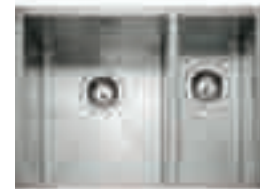
Zero 150 Inset or undermounted stainless steel sink ZERO150R