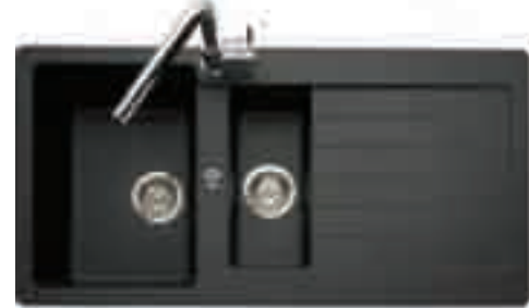
Encino 150 Inset Geotech granite sink with drainer (GR shown) ENC150xx‡