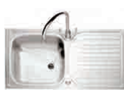
Crane 100 Inset stainless steel sink with drainer CR100SS