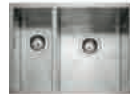
Zero 150 Inset or undermounted stainless steel sink ZERO150L