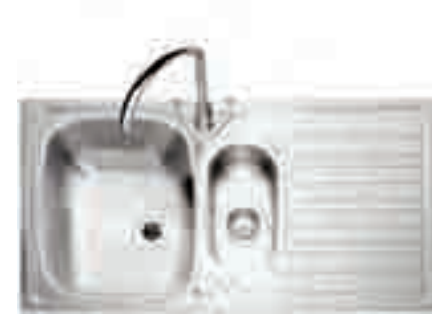
Crane 150 Inset stainless steel sink with drainer CR150SS