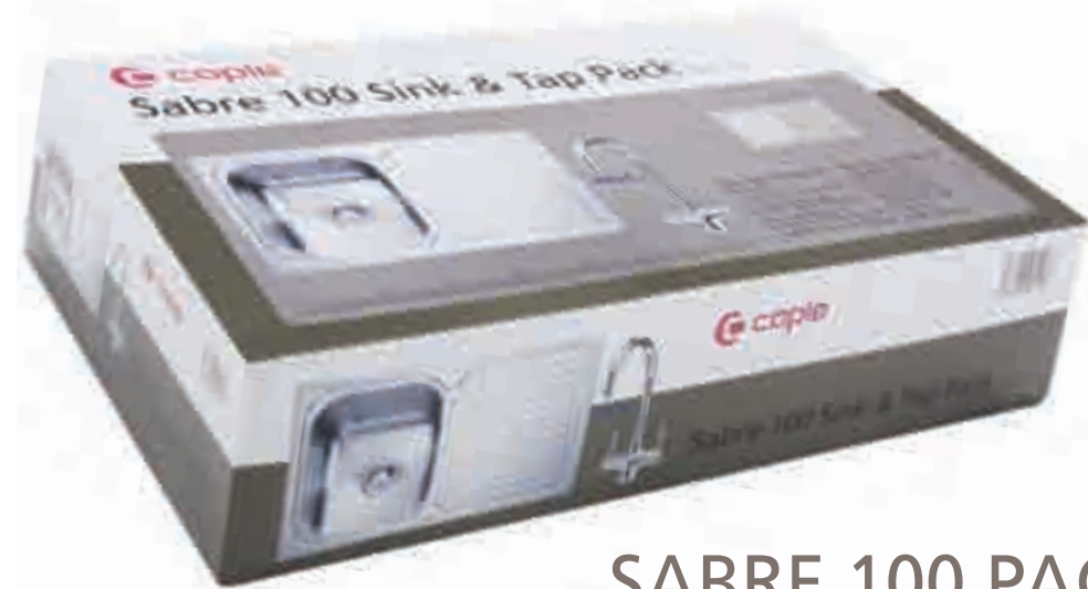
SABRE 100 PACK: