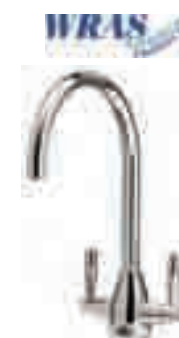
Avel Brushed Nickel AVE4/BN