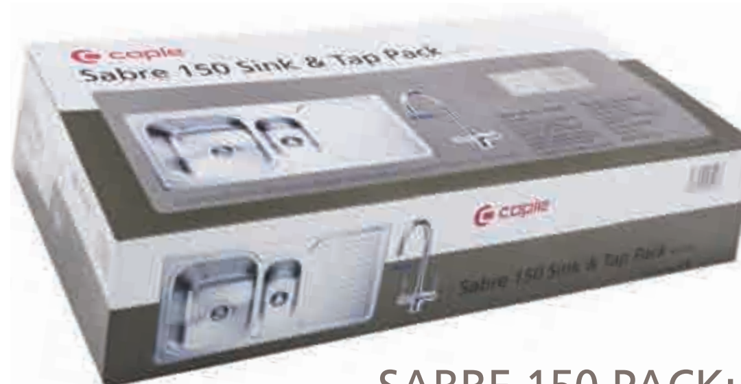
SABRE 150 PACK: