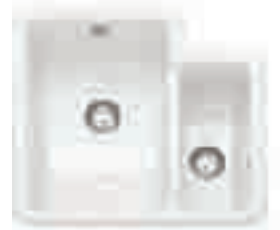
Paladin Ceramic inset or undermounted sink CPK800 waste required PAL150