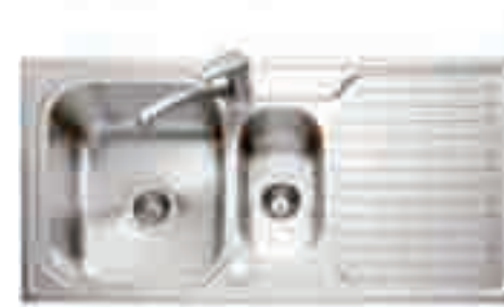
Dove 150 Inset stainless steel sink with drainer DO150SS