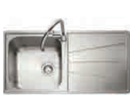
Blaze 100 Inset stainless steel sink with drainer BZ100/L or R