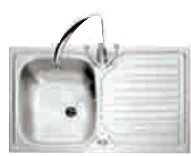
Crane 90 Inset stainless steel sink with drainer CR90SS