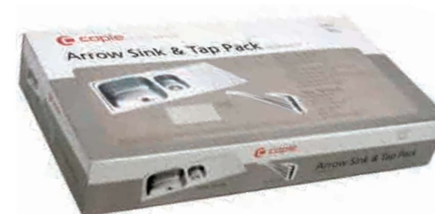
ARROW 150 PACK: PK/AR150