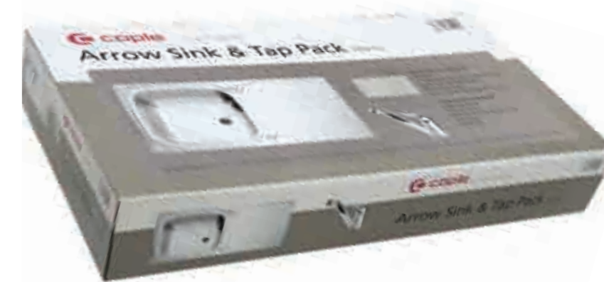
ARROW 100 PACK: PK/AR100