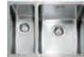
Mode 150 Inset or undermounted stainless steel sink MODE150L