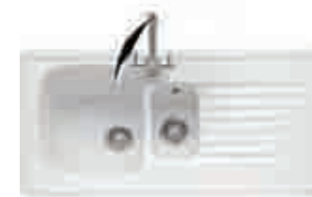
Ashford 150 Ceramic inset sink with drainer CPK800 waste required ASH15W