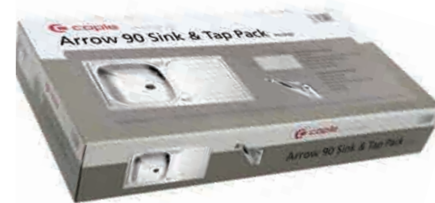
ARROW 90 PACK: PK/AR90