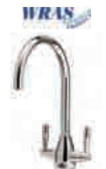
Avel Chrome AVE4/CH