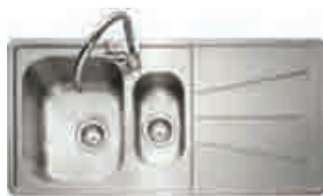
Blaze 150 Inset stainless steel sink with drainer BZ150/L or R