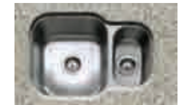
Form 150 Undermounted stainless steel sink FORM150U/UNI