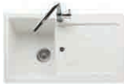
Encino 100 Inset Geotech granite sink with drainer (SO shown) ENC100xx‡

Swatches available please quote code SAMPGRAN