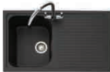
Envoy 100 Inset Geotech granite sink with drainer (Granite only) ENV100GR