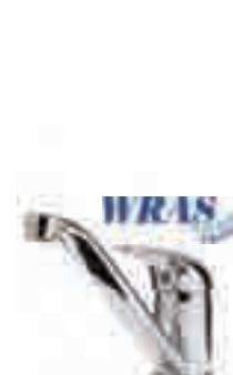
Single Lever SL6/CH