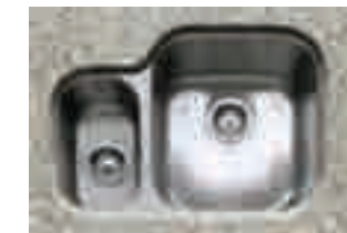
Form 150 Undermounted stainless steel sink FORM150U/L