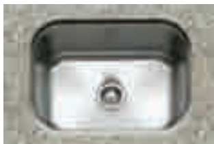
Form 54 Undermounted stainless steel sink FORM54/40