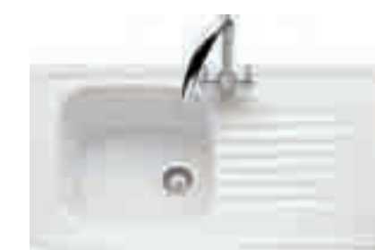
Ashford 100 Ceramic inset sink with drainer CPK500 waste required ASH1W