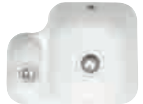
Nevara Ceramic undermounted sink CPK1100 waste required NEV150U