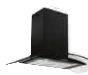
CGC910BK Wall chimney hood W 900mm Black and glass Push button controls 550m 3 /h Recirculation kit CAP61CF