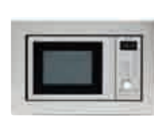
CM112 Built-in wall unit microwave and grill With frame Wall unit 17ltr capacity