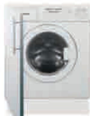
WDi2206 Fully integrated electronic condenser washer dryer Energy B, Wash A, Spin B 1200rpm 7kg wash, 5kg dry