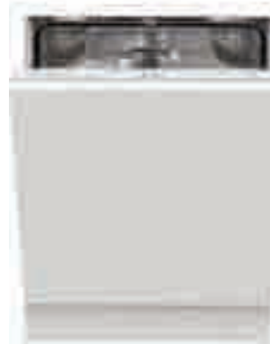
Di624 Fully integrated dishwasher W 600mm 4 Programmes Energy A+, Wash A, Dry A 12 place settings