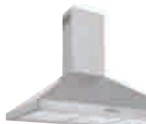
CCH900SS Wall chimney hood W 900mm Stainless steel Push button controls 350m 3 /h Recirculation kit CAP60CF