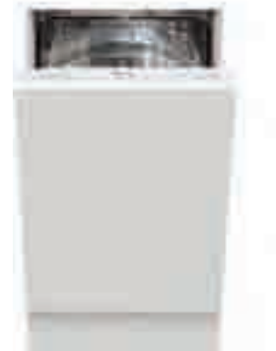
Di474 Fully integrated dishwasher W 450mm 4 Programmes Energy A+, Wash A, Dry A 9 place settings