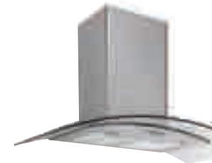
CGC910SS Wall chimney hood W 900mm Stainless steel and glass Push button controls 550m 3 /h Recirculation kit CAP61CF