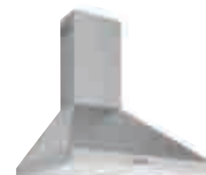
CCH600SS Wall chimney hood W 600mm Stainless steel Push button controls 350m 3 /h Recirculation kit CAP60CF