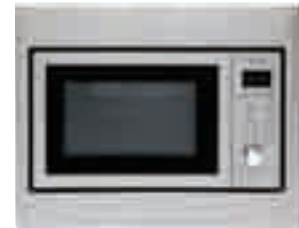
CM116 Built-in microwave and grill With frame 25ltr capacity