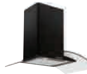
CGC710BK Wall chimney hood W 700mm Black and glass Push button controls 550m 3 /h Recirculation kit CAP61CF