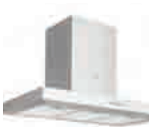
BXC910 Wall chimney hood W 900mm Stainless steel Push button controls 750m 3 /h Recirculation kit CAP61CF