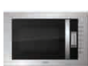
CM119 Built-in microwave and grill Electronic door display 25ltr capacity

Save ££s on our microwaves, dishwashers and laundry products shown below.