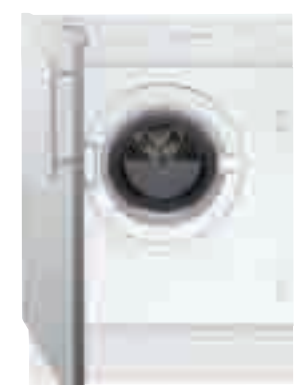
TDi100 Fully integrated vented tumble dryer Energy C 6kg