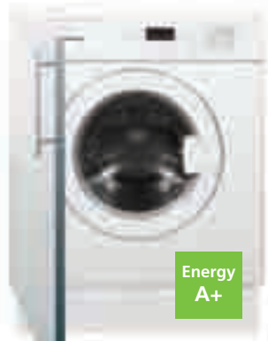
WMi2006 Fully integrated electronic washing machine Energy A+, Wash A, Spin A 1200rpm 7kg