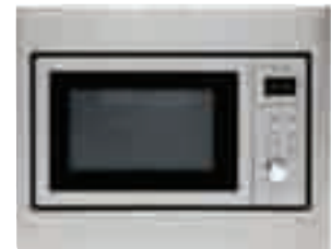
CM118 Built-in microwave combi and grill With frame 25ltr capacity