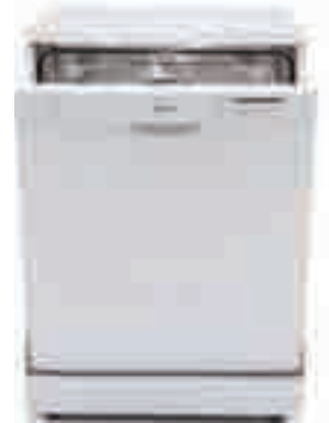
DF610 Freestanding dishwasher W 600mm 5 Programmes Energy A+, Wash A, Dry A 12 place settings