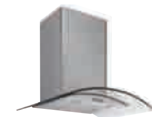
CGC610SS Wall chimney hood W 600mm Stainless steel and glass Push button controls 550m 3 /h Recirculation kit CAP61CF

Take advantage of these fantastic prices on our wall chimney hoods