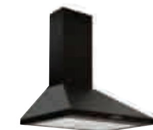
CCH600BK Wall chimney hood W 600mm Black Push button controls 350m 3 /h Recirculation kit CAP60CF