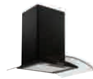
CGC610BK Wall chimney hood W 600mm Black and glass Push button controls 550m 3 /h Recirculation kit CAP61CF