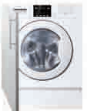
WDi2203 Fully integrated electronic condenser washer dryer Energy B, Wash A, Spin B 1200rpm 6kg wash, 3kg dry