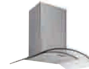
CGC710SS Wall chimney hood W 700mm Stainless steel and glass Push button controls 550m 3 /h Recirculation kit CAP61CF