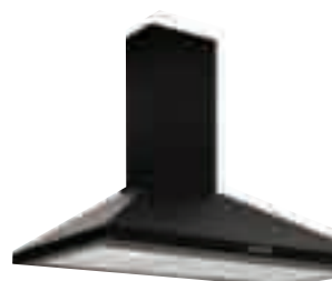
CCH900BK Wall chimney hood W 900mm Black Push button controls 350m 3 /h Recirculation kit CAP60CF

appliances SPECIAL OFFERS SEPTEMBER - DECEMBER 2014