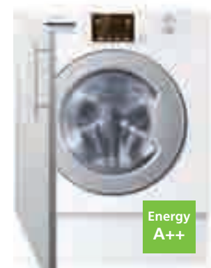
WMi2003 Fully integrated electronic washing machine Energy A++, Wash A, Spin B 1200rpm 6kg